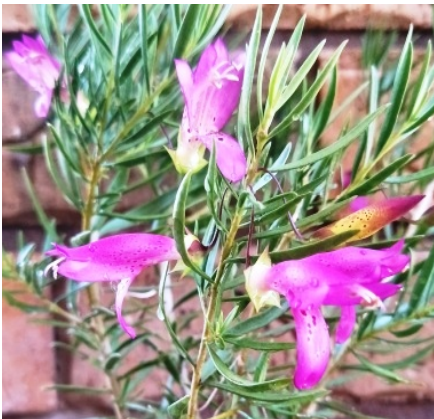
Eremophila maculata hybrid

Currently 214 species of Eremophila are recognised, some 70 or so are published. Approximately 75% of Eremophilas are insect pollinated, with the remainder being bird pollinated.