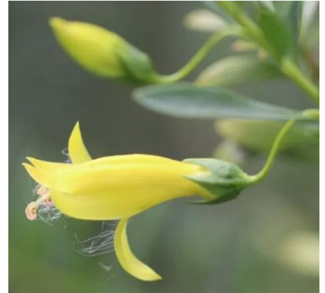
Eremophila maculata 'Aurea'

As a rule Eremophilas will grow on relatively poor soils, but they do respond to fertilisers, provided they are not applied too heavily and too often.