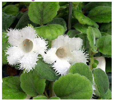
White Fringe Flower