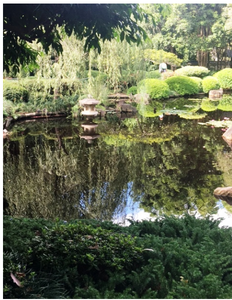
Mount Coot-tha Botanic Gardens, Brisbane