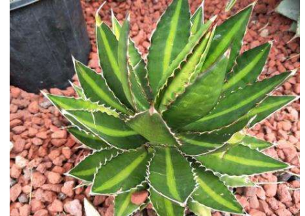
Yvonne and David's great little succulent garden

The planned Autumn Plant Sale scheduled for the first Saturday in May unfortunately had to be cancelled, not due to COVID this time, but due to a large party booking in the Community Centre, meaning that the car park had to be reserved for (of all things) cars! This is the first time to my knowledge that we have ever clashed with anyone else on a Plant Sale day. We will need to book the car park well ahead in future.