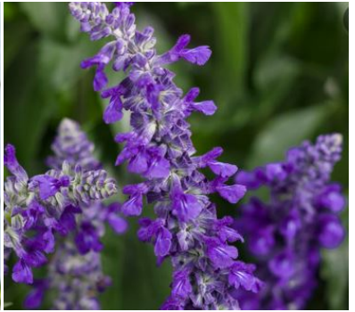
Salvia 'Big Blue'