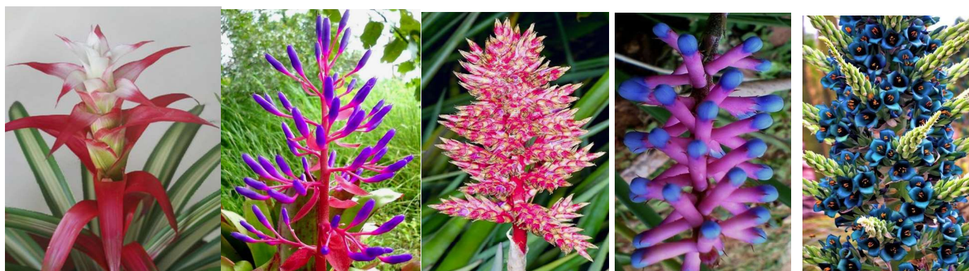
Some amazing shapes and colours in the Bromeliad family